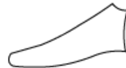
Water Plant Eater